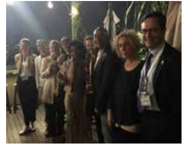
Delegates from the conference

In total, UCT was represented in 15 different oral presentations over the two-day conference while UCT students were awarded the Nursing Award in Research and Best Publication in the student category.