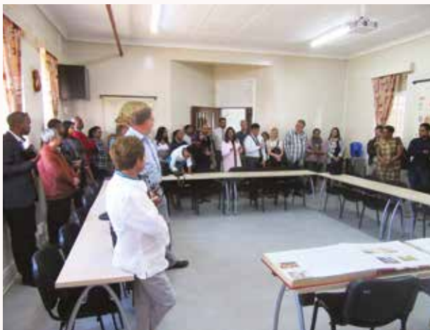
Opening of Centre